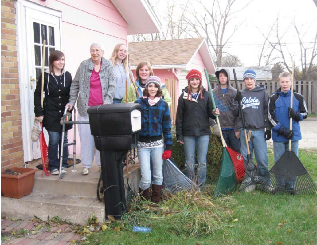
One of our student groups raking leaves

As many of you know there is bill in the house trying to be passed. That is the Health Reform Bill. House Democrats passed historic legislation on November 14 to expand the nation's health-care system.