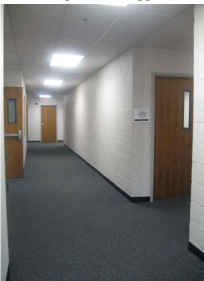
The blank walls of the 3rd floor

I think that this will no doubt be a very exciting project, one we can use to grow as a group of students, one we can use to further this great community. Though, as we do, we must take this into our consideration: what is a sign or painted walls going to show if the people of our community do not show themselves as Christians in this school, home, and world?