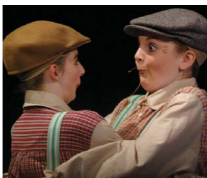
Tweedledee and Tweedledum

Building the creative set was fun because there was music playing and lots of laughter filling the air from happy and relaxed friends. When asked about the finished set