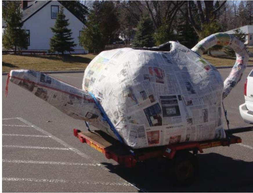
Getting the teapot ready to make its trip to the High School

Barack Obama has passed his economic stimulus plan. The total cost of this plan will be 775 billion dollars over the next two years. $300 of this bill will be for tax cuts; companies will be able to write off losses from 2008 and 2009. They can also write off other expenses up to 250,000 dollars in 2009 and 2010. This plan will create up to 3 million new jobs. Stimulus funds will be used to invest in infrastructure around the country including transportation, roads, healthcare, and education.