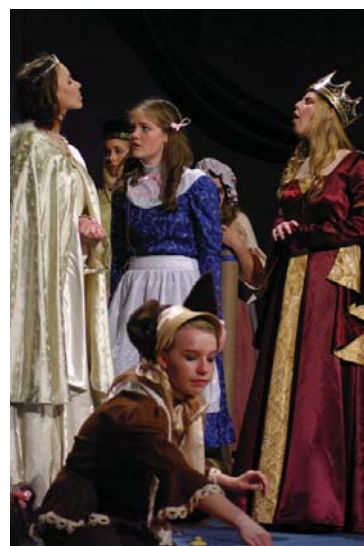
"Can you play croquet?"